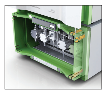
FX-20 pump delivers precise flow for retention time repeatability.

Ultra high performance means the highest resolution, highest sensitivity and fastest analysis – in other words, a superlative LC system. Flexar FX-20 is the ultimate in UHPLC with maximum throughput and minimum stress for you. Getting more sample information in less time lets you be more productive. Just what you want.