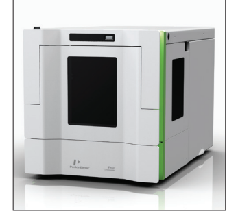
Features easy-open access to the autosampler.