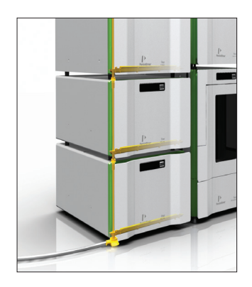
Unique hidden inter-component drainage system protects the user and system from leak errors.

Let's start with the basics – ergonomics, safety, reliability, ease, performance. You get it all with the Flexar HPLC. The elegant user interface is streamlined to improve throughput and optimize operator safety. And Flexar simplifies your process so you can focus on your application. It's the HPLC system you'll count on day after day.